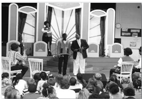
Birmingham Children's Theatre Tuxedo Junction Performance

Approximately 100 nights of lodging provided by the American Cancer Society will help cancer patients gain access to potentially life-saving treatment. - LDF