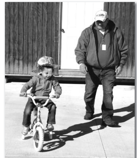
Mission of Hope Christmas Toy, Coat, and Shoe Giveaway