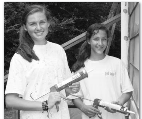
Habitat for Humanity Youth Build

Oakman High School SGA, Cancer and Military Care Packages: To assemble at least 75 care packages for patients receiving cancer treatments at the Walker