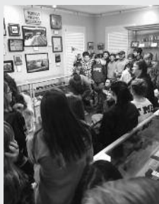
Carbon Hill 8th Grade