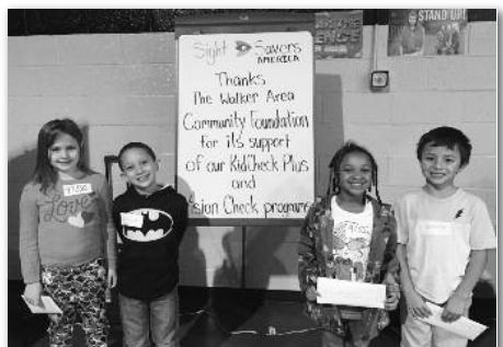
Sight Savers Americas Head to Toe Health Screenings

Service projects, leadership activities, transportation, and supplies will be coordinated for Maddox Middle School's Girl Strong and JUMP leadership programs. - LDF, LSF, RFF