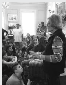
Parrish Elementary 6th Grade