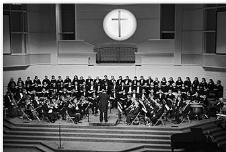
Walker County Christian Chorus: The Messiah

The Walker County Children's Advocacy Center will continue to provide services, add free confidential group