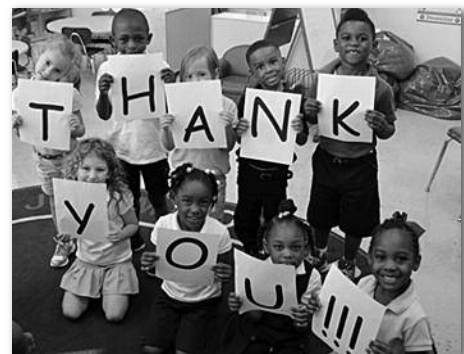
Success By Six

During the 2015-16 school year, vision screenings will be conducted at Maddox Middle and Memorial Park Elementary through Sight Savers America's Vision Check program, and head-to-toe health screenings will be conducted at West Jasper Elementary and T.R. Simmons Elementary through their KidCheck Plus program. - CF