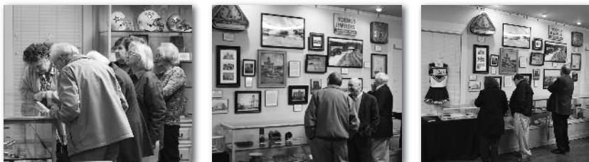
A Walk Through Walker County by Pat Morrison

Group tours are available upon request. For more information, call (205) 302-0001