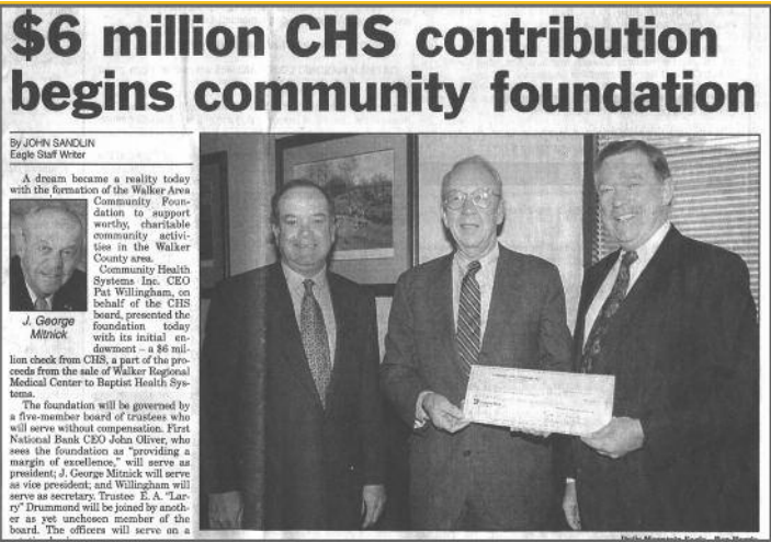
Founding of the Foundation in 1995