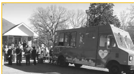
Hope House Church Loaves and Fish Food Truck

Backyard Blessings: To meet the needs of hungry school children in Walker County through a weekend backpack food program.