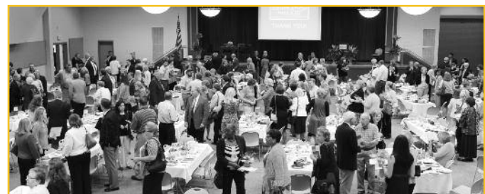
Annual Luncheon in 2014