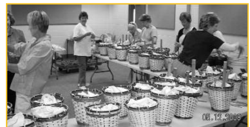
Volunteers getting ready for the Annual Luncheon in 2008