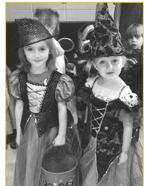
Curry High School Head Start Trick or Treat

Walker County Community Action Agency: To provide an activity for the youth of Walker County through a basketball/volleyball summer program.