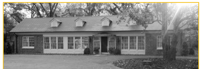
Current office constructed in 2011