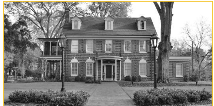
Opening of the Bankhead House and Heritage Center in 2010