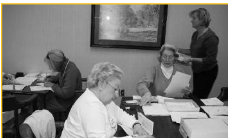
Volunteers at work in 2007