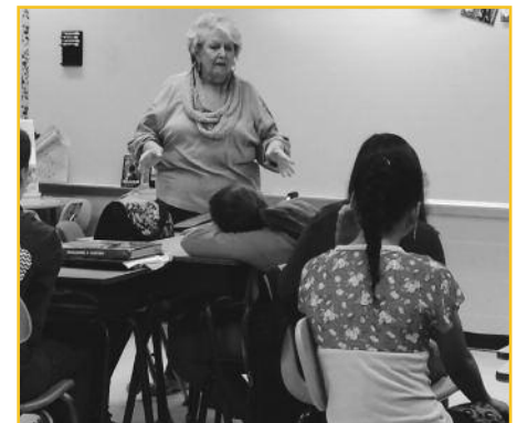
Walker County Arts Alliance

Walker High School: To sponsor the Birmingham Contemporary Dance Company in a performance and to give the students access to the performing arts.