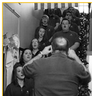
Bevill State Concert Choir