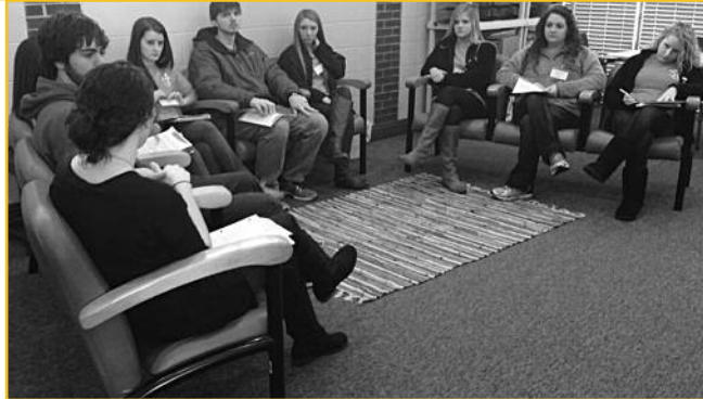
Youth Leadership Walker County discusses grants.

Arc of Walker County: To purchase two AED's (Automated External Defibrillator) and to purchase new adult and child training mannequins.