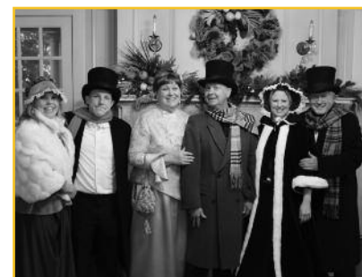
"Charles Dickens" Carolers