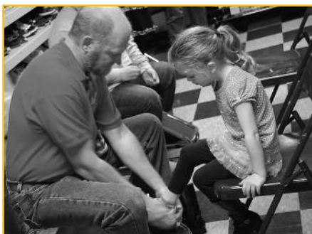
Mission of Hope Sneaker Giveaway

Walker County Christian Chorus: Operating support of The Messiah production.