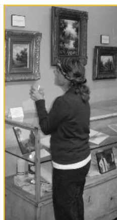
Looking at Landscapes