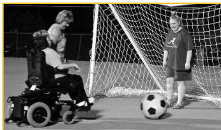
Dream Team Soccer