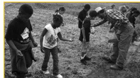
West Jasper Elementary students plant seeds at Camp McDowell Farm School