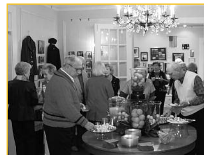
Fellowship and Fun