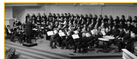
Walker County Christian Chorus performing Messiah

Wild South: To continue their successful Helping Hands Project in Alabama's Bankhead National Forest.