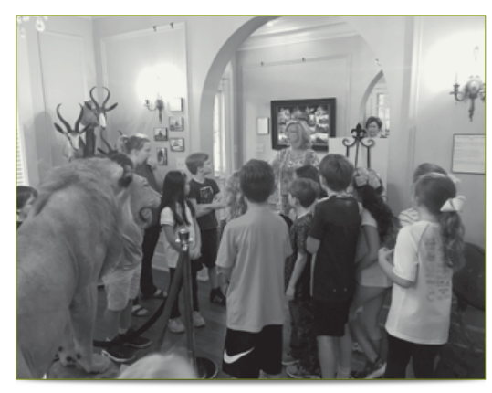
Bankhead House & Heritage Center