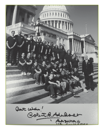
Parrish Elementary School