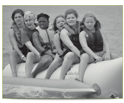
Camp Wheeze Away

Wild South's Wild Lands Stewardship in the Bankhead Forest: Advancing Volunteer Engagement and Wilderness Education program provides volunteer opportunities and training. CF