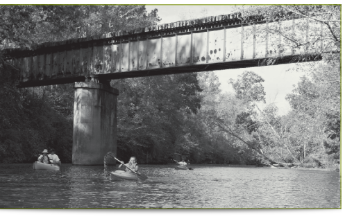
Health Action Partnership