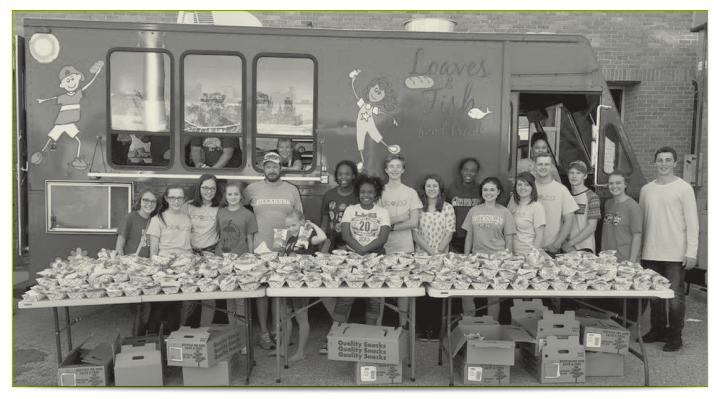
Hope House Church

Victims of Violent Crime Fund was organized to create awareness of victims of violent crime in Walker County, Alabama.