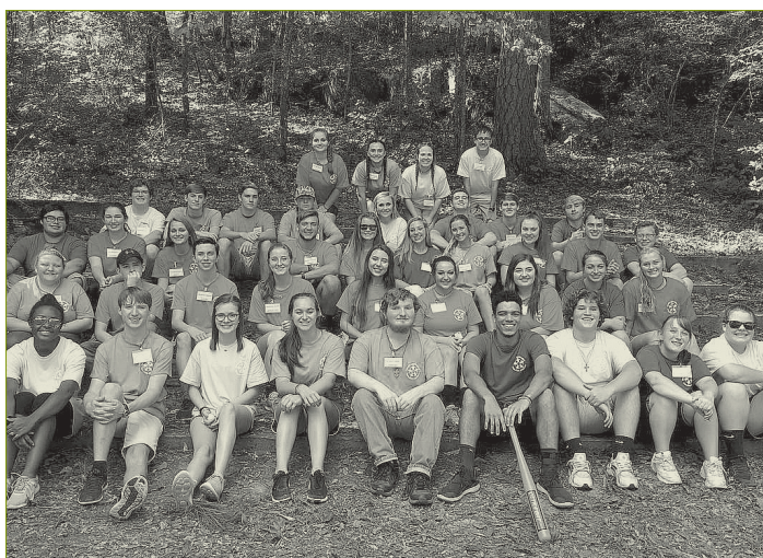
Youth Leadership Walker County

The Community Foundation offers the students an opportunity to become grantmakers as they conduct their own grant review process. They receive grant applications from area nonprofits and school clubs, review the applications, conduct site visits and determine how to give away the $10,000 invested in them through the Foundation.