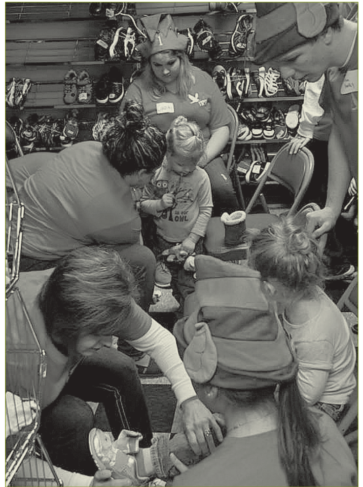
Mission of Hope shoe giveaway

The Winston County Arts Council received a grant to support their Free State Theater Troupe and quality productions for their community. WACF