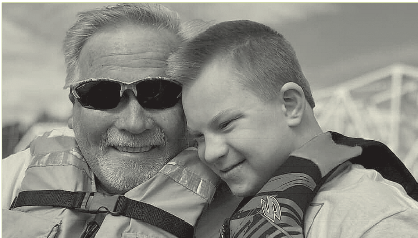
C.A.S.T. for Kids

The Walker Area Community Foundation awards creative, visionary and sensitive grants and works to multiply our local giving with outside sources of assistance. Together, the Walker Area Community Foundation and its Component Funds have awarded more than $1 million in grants to the following nonprofits during over the last six months.