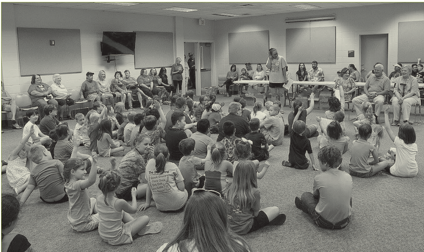
Summer Reading Program Graduation Carl Elliott Regional Library

City of Lights Dream Center received funding to provide transportation to students who attend their afterschool and summer programs. WACF, RFF, BF, LDF