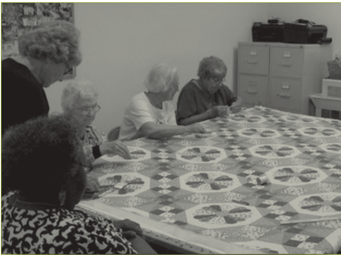
Positive MaturityRSVP Quilting

Smile-A-Mile Place and their Hospital Outreach Program brings life-enriching programs to the Hematology/Oncology patients at Children's of Alabama. Funding also supports their family programs and services. WACF