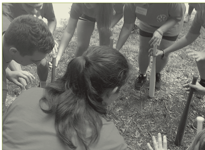
YLWC Team Building