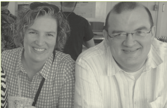
KUB Philanthropic Fund