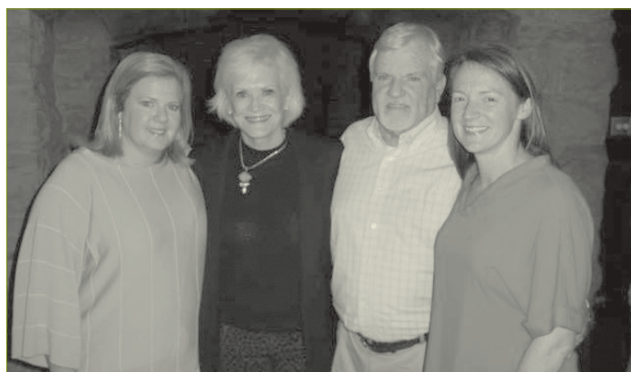
The Kelley Family Fund