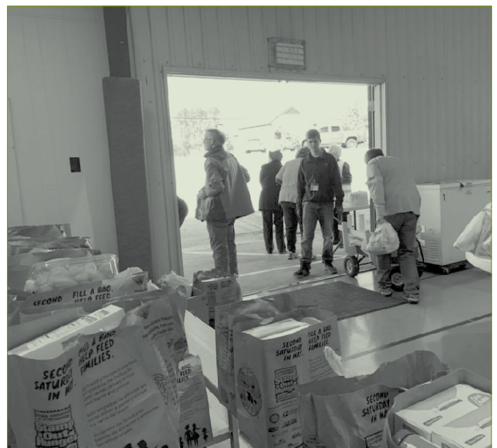
Mount Vernon Baptist Church Food Bank

Funds were granted to the Mt. Vernon Baptist Church for their food bank, serving 120 elderly households, school students, and over 100 families in the community. CF, RFF, LDF