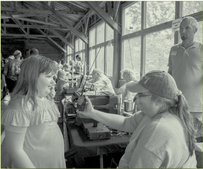
Walker County ARES

The Wellhouse rescues and rehabilitates women and adolescents who are victims of human trafficking. Their grant will enhance services available to Walker County victims. CF