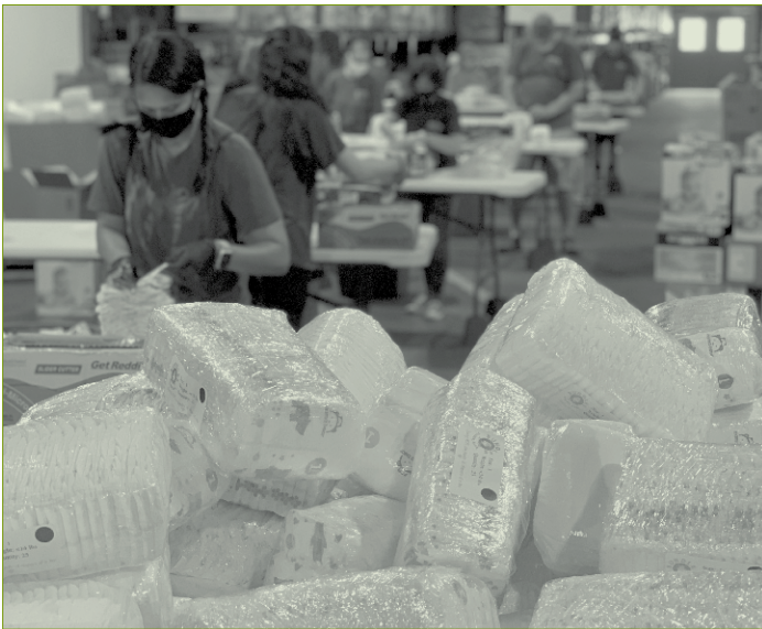
Bundles of Hope Diaper Bank

Bundles of Hope Diaper Bank grant provides diapers and wipes in Walker County through their distribution partners. CF