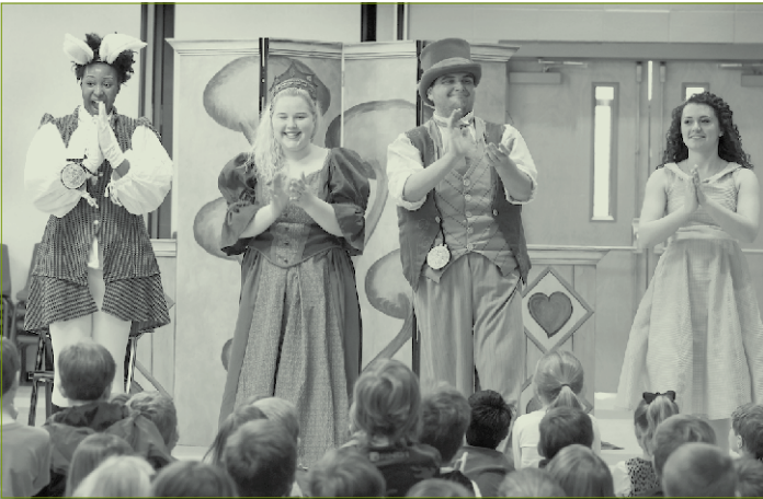
UAB Department of Theatre

UAB Department of Theatre received a grant to bring performances to Walker County. BF