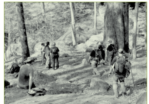
Camp McDowell Venture Out!