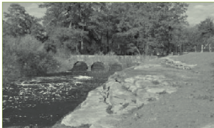
Friends of Downtown Jasper Town Creek Park

St. Mary's Episcopal Church: make renovations to start a First-Class Pre-K program.