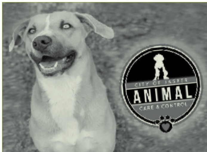
City of Jasper Animal Control