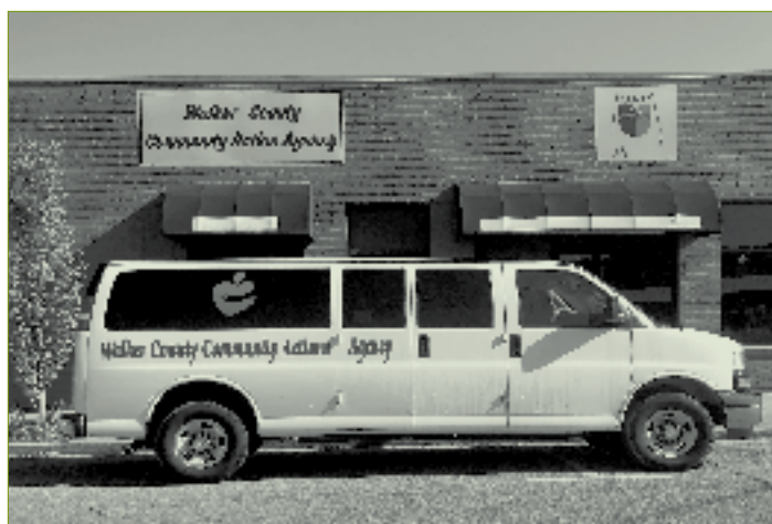
Walker County Community Action Agency