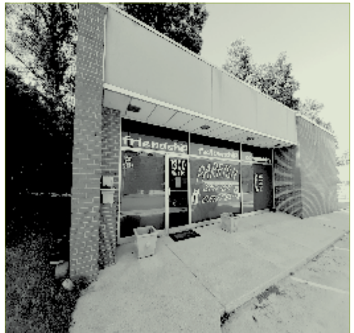
Parrish Senior Center