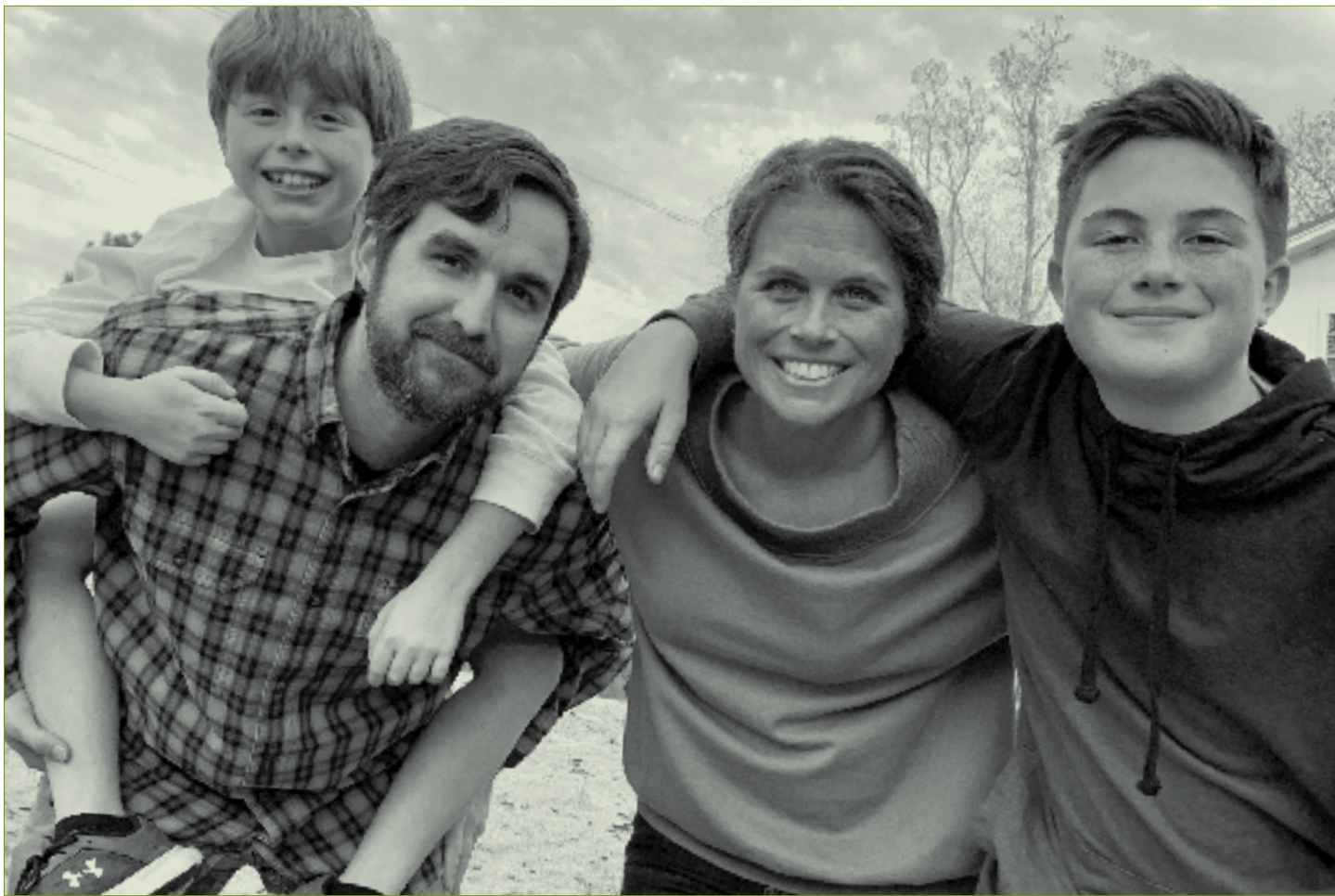
Matthew and Ashley Laird Fund