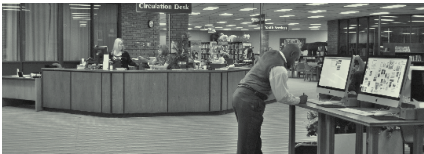
Carl Elliott Regional Library

First United Methodist Church: renovations to the basement of the church for their preschool.