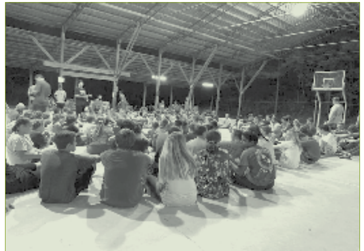
Indian Creek Youth Camp

Youth Advocate Programs: to provide additional services for at-risk youth.