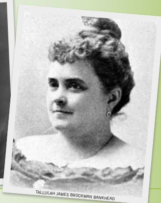
TALLULAH JAMES BROCKMAN BANKHEAD