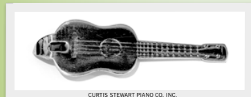
CURTIS STEWART PIANO CO., INC.

A little trip down memory lane ... do you recognize these Walker County businesses?