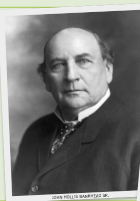
JOHN HOLLIS BANKHEAD SR.

William served as Speaker of the U.S. House of Representatives and built his family home, which is now the Heritage Center.