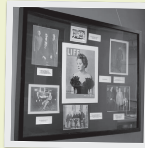
Shadow box of family photos and a Time magazine with Tallulah on the cover