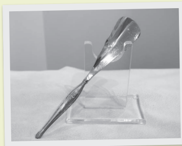
Silver Shoehorn of U.S. Senator John Hollis Bankhead, II