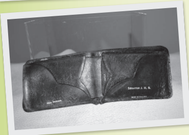
Wallet of U.S. Senator John Hollis Bankhead, II