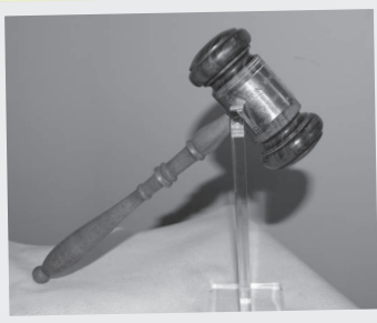
Gavel of Speaker of the U.S. House of Representatives William B. Bankhead given to him by Speaker John N. Garner dated March 4, 1933.