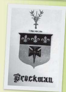
Print of the Brockman family crest